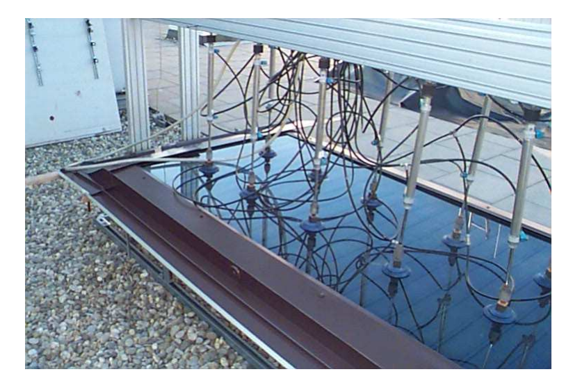
Figure 10: Test of mountings for a angular roof, integrated

Figure 9: Position of of additional fixings for regions with high wind speed