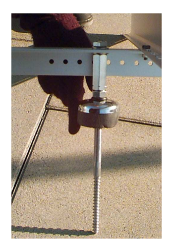
Figure 6: Mountings for a angular roof, on the roof; special screw installation

Figure 5: Mountings for a angular roof, on the roof; special screw installation