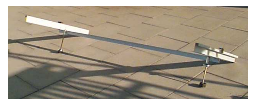
Figure 5: Mountings for a angular roof, on the roof; special screw installation