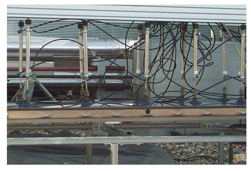
Figure 4: Negative pressure test of fixings between the cover and the collector box