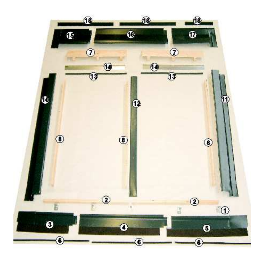
Figure 7: Mountings for a angular roof, integrated