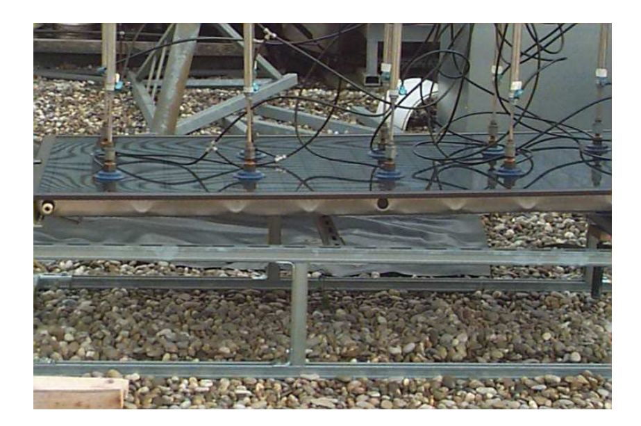
Figure 3: Positive pressure test of the collector cover

Method used to apply pressure:suction cups, pressedMaximum pressure load:2400 Pa