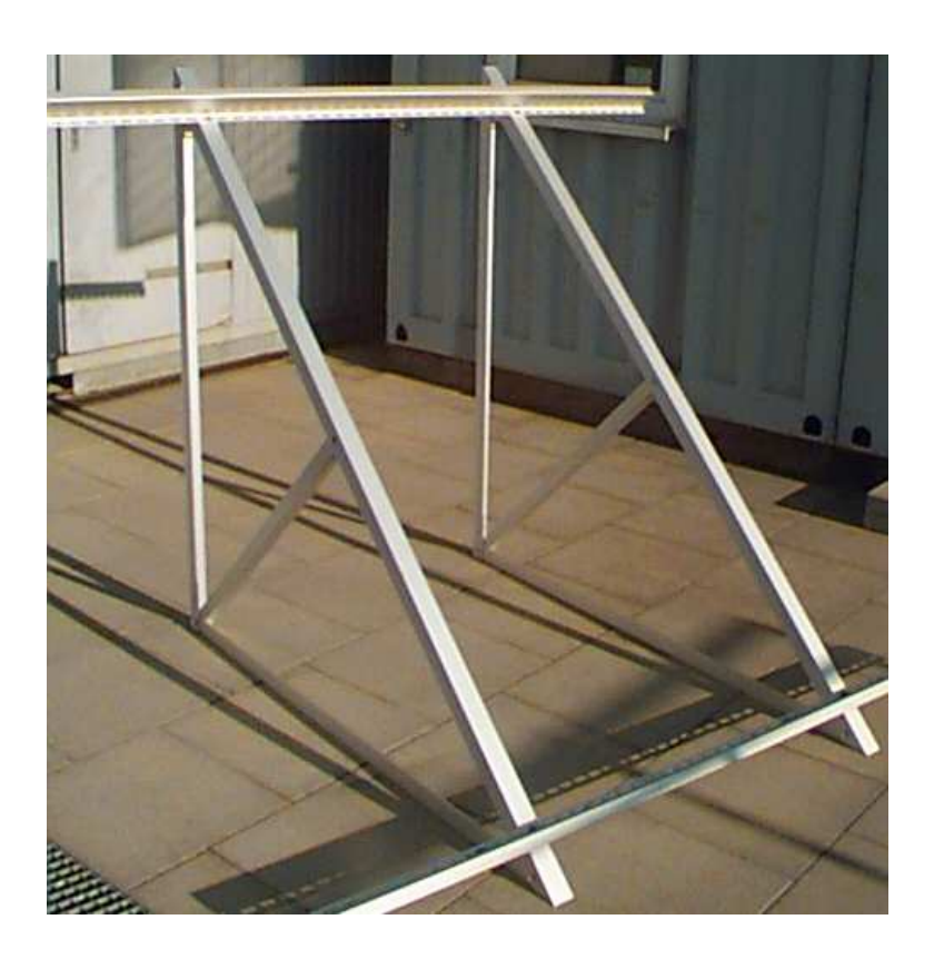
Figure 11: Mountings for free mounting