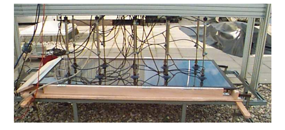
Figure 9: Position of of additional fixings for regions with high wind speed