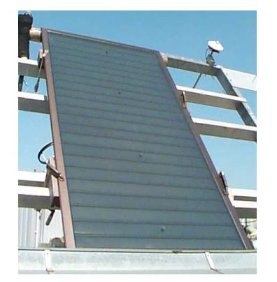
Figure 1: Picture of the collector thermo|solar 300N2P mounted on the efficiency test facility (Tracker) of Fraunhofer ISE